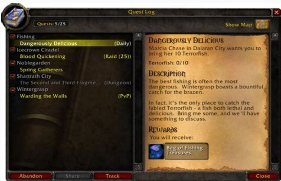
Wow classic addons 1.12.1 quest helper. Best quest helper addon wow classic tbc. Best quest helper addon wow classic. Wow tbc classic quest helper addon. Wow classic quest helper addon deutsch. Wow burning crusade classic quest helper addon.